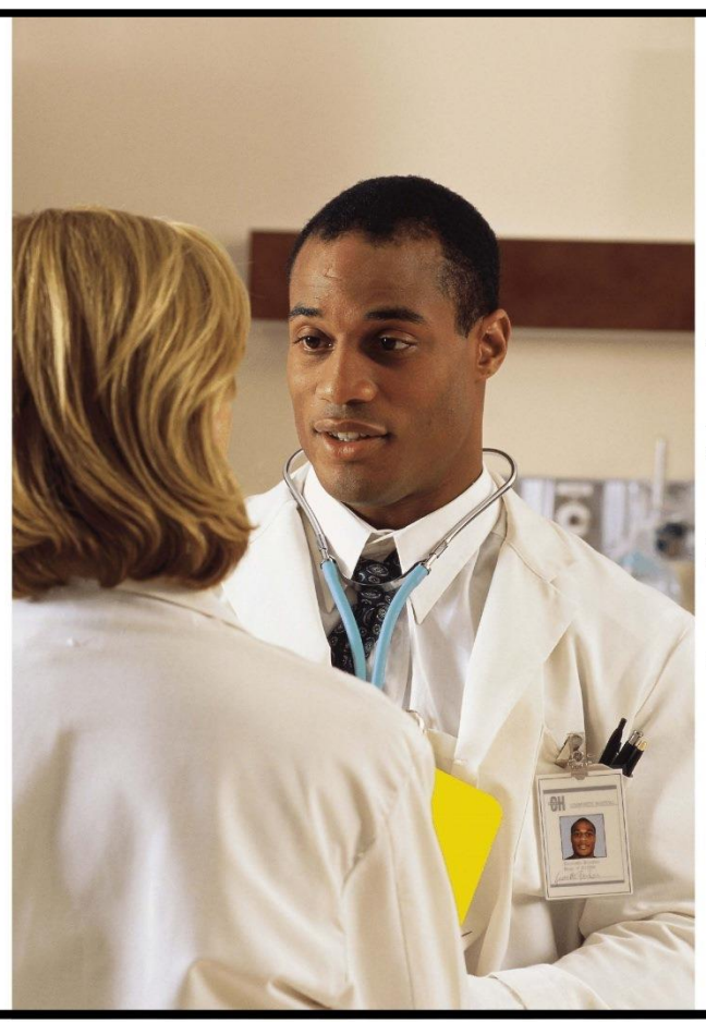
A Guide to Maryland Law on Health Care Decisions (Forms Included)

STATE OF MARYLAND OFFICE OF THE ATTORNEY GENERAL